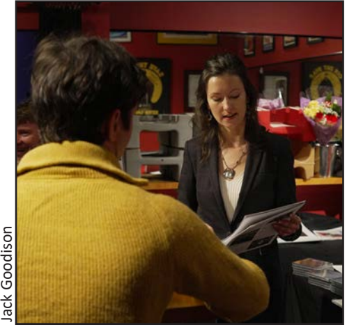
Film festival attendees stayed after the show to learn more about the work of VWS and how they can help protect three proposals for new parks in the Interior Wetbelt.

final page of this newsletter for letter-writing materials.