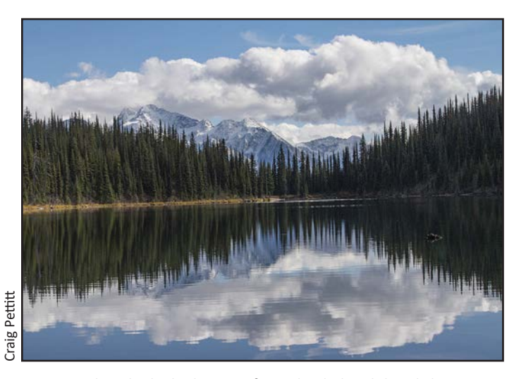
Morgan Lake- The high elevation forest loaded with hair lichens is excellent winter range for mountain caribou.

To me our park proposal equals any of the many provincial and few national parks I have done wildlife research in, for both ecological and scenic values — world class! Although we saw no sign of mountain caribou, it was good to know there are small nucleus herds still surviving that will have a much greater chance of recovering if the park proposal is protected.