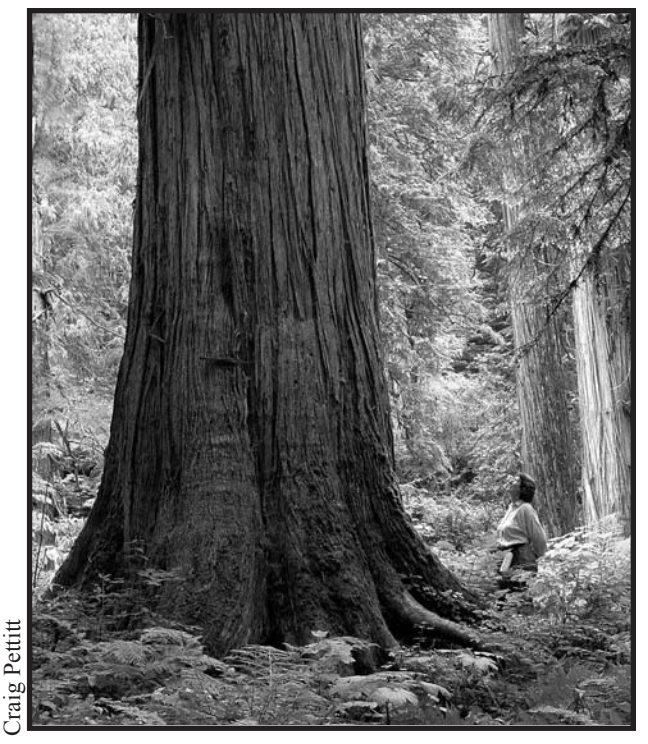
Rare antique Inland Temperate Rainforest in the upper Incomappleux Valley.

gulate Winter Range can still have some logging, as well as mining, power projects and tourism development such as lodges and glading for heli-skiing. The protection is weak and not permanent. It could disappear if the caribou fail to survive; but what about the many other species at risk that depend on old-growth forest?