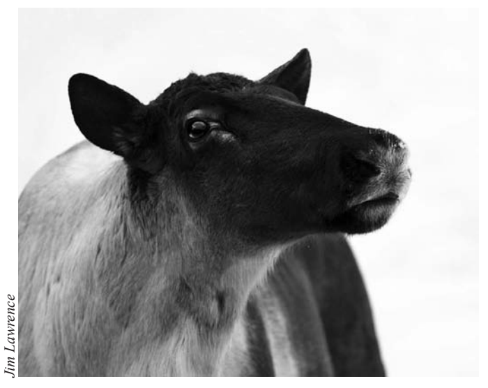
At risk of disappearing forever: mountain caribou